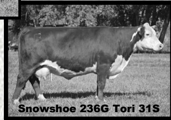
Tuff's Dam pictured at 9 years

Tuff has gone from Lead Bull in our 2013 Denver pen to Lead Herd Sire in our program. He has 11 sons in our offering each with Tuff's thickness, rib volume and correctness. His dam is becoming a cornerstone in our program.