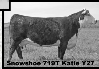
Full Sister in Blood to Paterno

Paterno produced our high selling bull in 2014 and has been proving his worth ever since. He offers balance, extra length and excellent feet and legs to cover the steep hills and rough ground of our Wolf Mountain pastures.