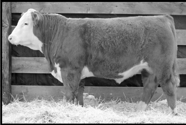
20C Snowshoe 6Z Porterhouse A06 20C P43618549 February 15, 2015

SHF Rib Eye M326 R117 Snowshoe R117 Ribeye T41 6Z Snowshoe M33 Savanna T41 ET KJ HVH 33N Refresh 483T ET Snowshoe 483T Ldy Victoria A06 Snowshoe 579 Lady Victoria 26P