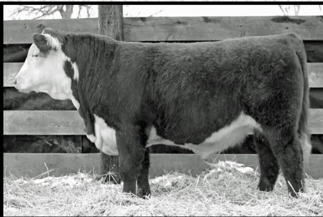
28C Snowshoe X51 Revolution 28R 28C P43618541 February 21, 2015

MSU TCF Revolution 4R KCF Bennett Revolution X51 KCF Miss Proficient U201 PW Victor Boomer P606 Snowshoe P606 Mystic Boom 28R ET RPH Miss Manip 6023